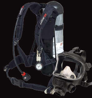
Scott Safety ProPak