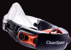
CleanSpace Ultra Half Mask