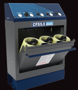
Bauer Containment Fill Station