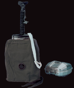
MSA SSR 30/100