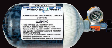
Biomarine Spare Oxygen