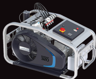
Bauer Mariner 320