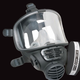
Scott Safety P3