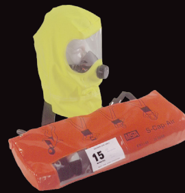
MSA S-CAP Complete 15 Minute Duration