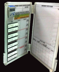
BA Tally Board