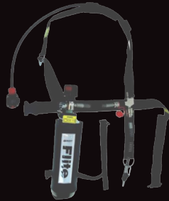
Scott Safety Flite