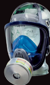
MSA Advantage 3100