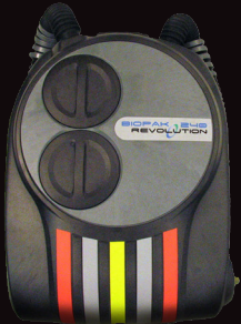
Biomarine Biopak 240 Revolution