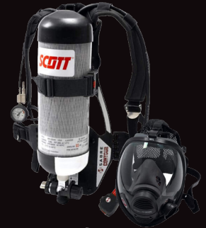
Scott Safety Contour