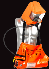
Scott Safety Elsa 15 Minute Escape Set