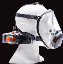
CleanSpace Ultra Full Mask